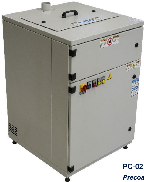
PC-02 Precoating Unit