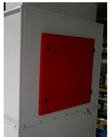
Service access door